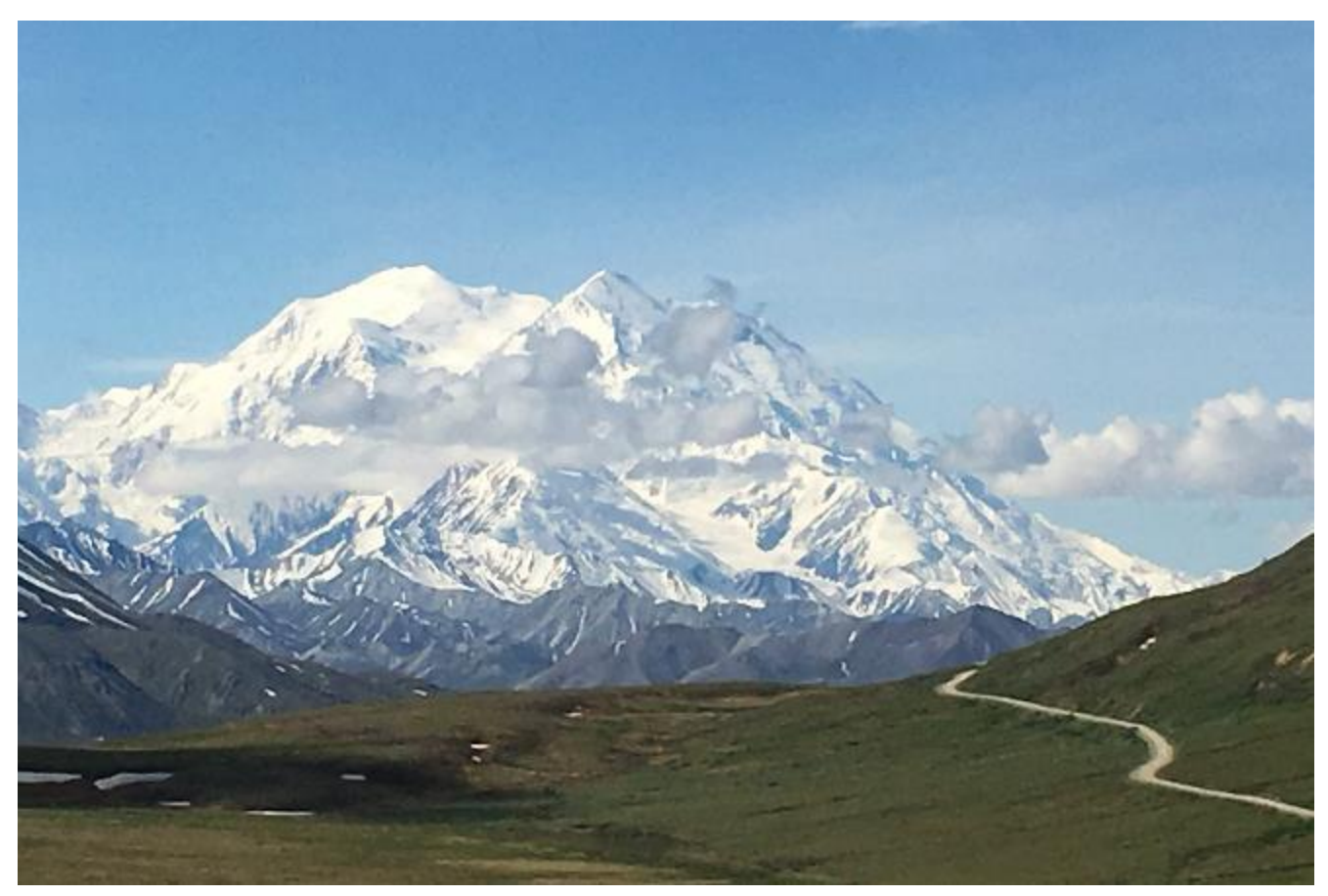
Denali, Alaska

(lasting about eight to nine hours) will allow us to see much of this spectacular park. The birds are impressive, with Golden Eagle, Gyrfalcon, Willow Ptarmigan, and Northern Shrike all present, although sometimes elusive. However, even the most dedicated birder may be distracted by the grandeur of the surroundings and by the opportunity for encountering large mammals—Moose, Caribou, Grizzly Bear, Dall's Sheep, Red Fox, and even Gray Wolf. On a clear day the view of Denali from Stoney Pass is one of the most spectacular sights in the world!