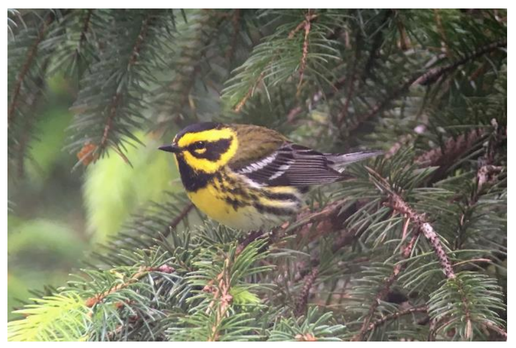
Townsend's Warbler, Seward, Alaska

NIGHT: The Coast Inn at Lake Hood, Anchorage