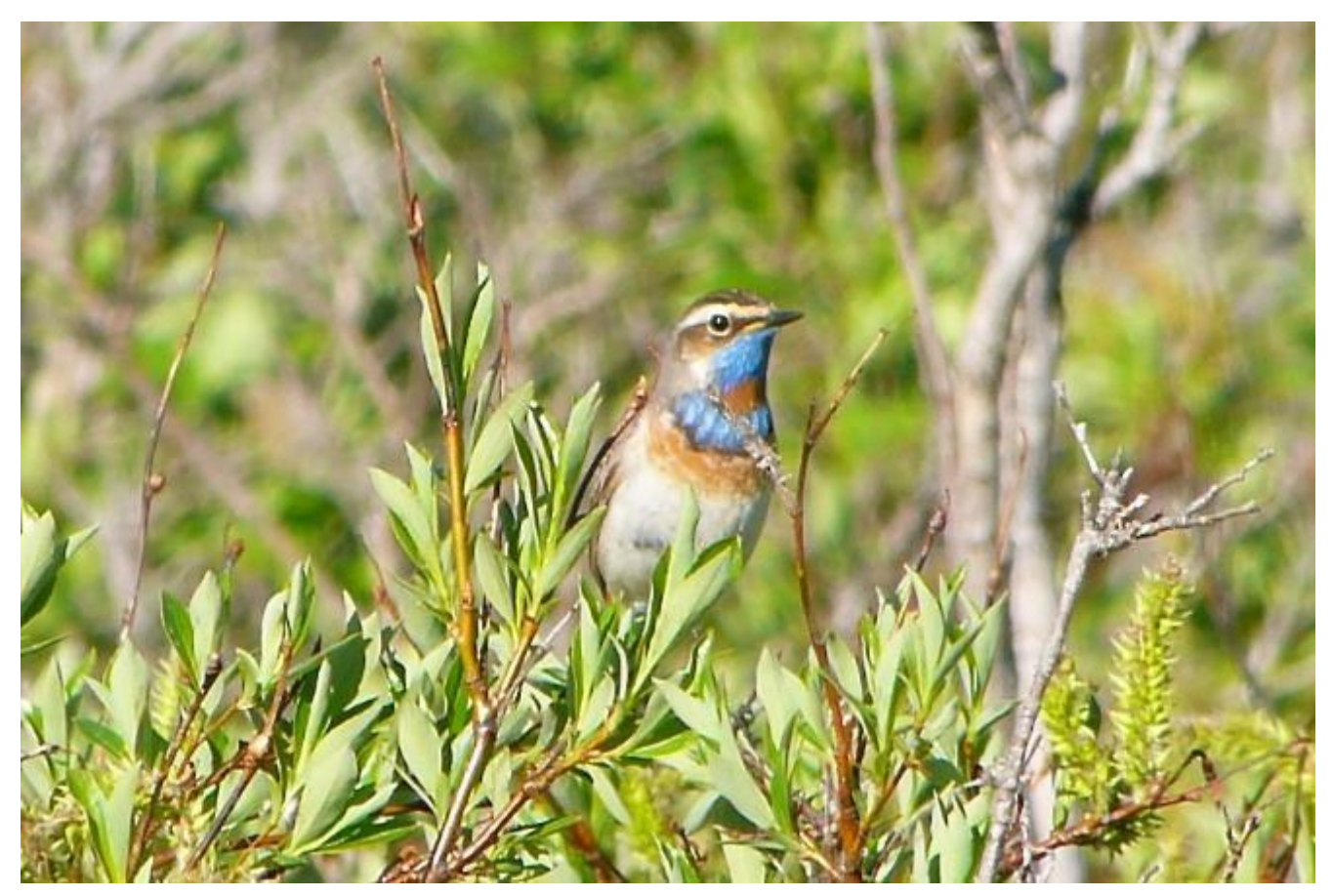
Bluethroat, Nome, Alaska

June 11, Day 1: Arrival in Anchorage. Participants on the pre-trip will arrive in Anchorage today and take the complementary shuttle to our hotel. We'll meet in the hotel lobby at 6:30 p.m. for a brief orientation session, followed by dinner. We will likely stop by a city park after dinner for a very brief taste of Anchorage birding. Greater Scaup, Red-necked Grebe, Short-billed Gull and Arctic Tern are among the many possibilities.