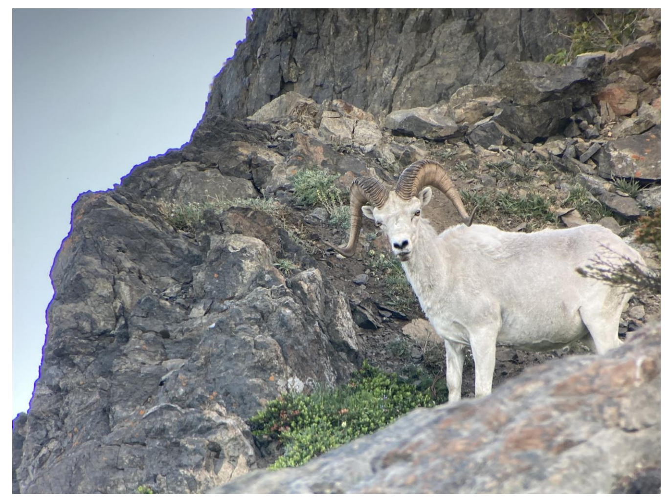
Dall's Sheep

The Kenai Peninsula has much to offer; perhaps an American Dipper bobbing along a rushing, glacier-fed stream; a Barrow's Goldeneye in the reflection of a snow-capped peak on a glass-smooth lake; a Spruce Grouse nervously leading her downy charges safely through the forest; or an American Three-toed Woodpecker quietly flaking bark from a dead spruce. Frequent stops are inevitable, whether to appreciate the majesty of a close Bald Eagle, to scope a distant slope for Mountain Goats, or simply to snap a picture of some dazzling alpine backdrop.