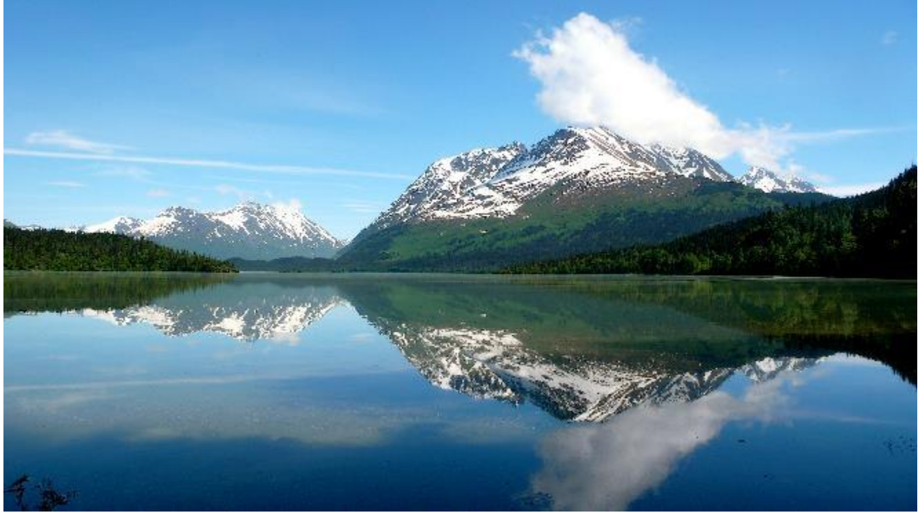
Trail River Lake, Alaska

Alaska is a land of unparalleled non-stop scenery, fabulous birding (including many species found nowhere else in the United States) and spectacular, large mammals. Known as the "Last Frontier" (and outposts such as Nome certainly live up to this), Alaska offers the visitor a chance to see true wilderness. This tour combines the vast expanses of tundra and taiga surrounding the Denali area with the moist spruce forests of the Kenai Peninsula and the magnificent glaciers and sea stacks of Kenai Fjords National Park. A pre-trip to Nome and the Seward Peninsula provides the perfect compliment. In Nome, we will seek out Siberian species such as Bar-tailed Godwit, Bristle-thighed Curlew, Aleutian Tern, Bluethroat, Arctic Warbler, and Eastern Yellow Wagtail that reach the United States only in western Alaska. Other northerly species with larger ranges such as Gyrfalcon, Rock and Willow ptarmigan,